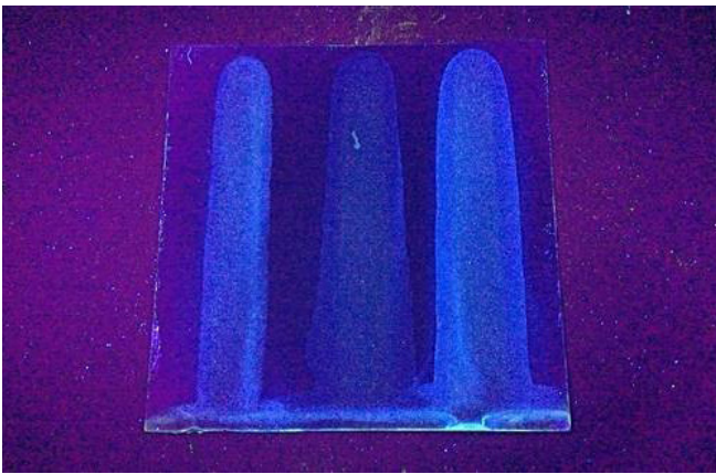
Left: Competitor A; Center: Magnaflux; Right: Competitor B